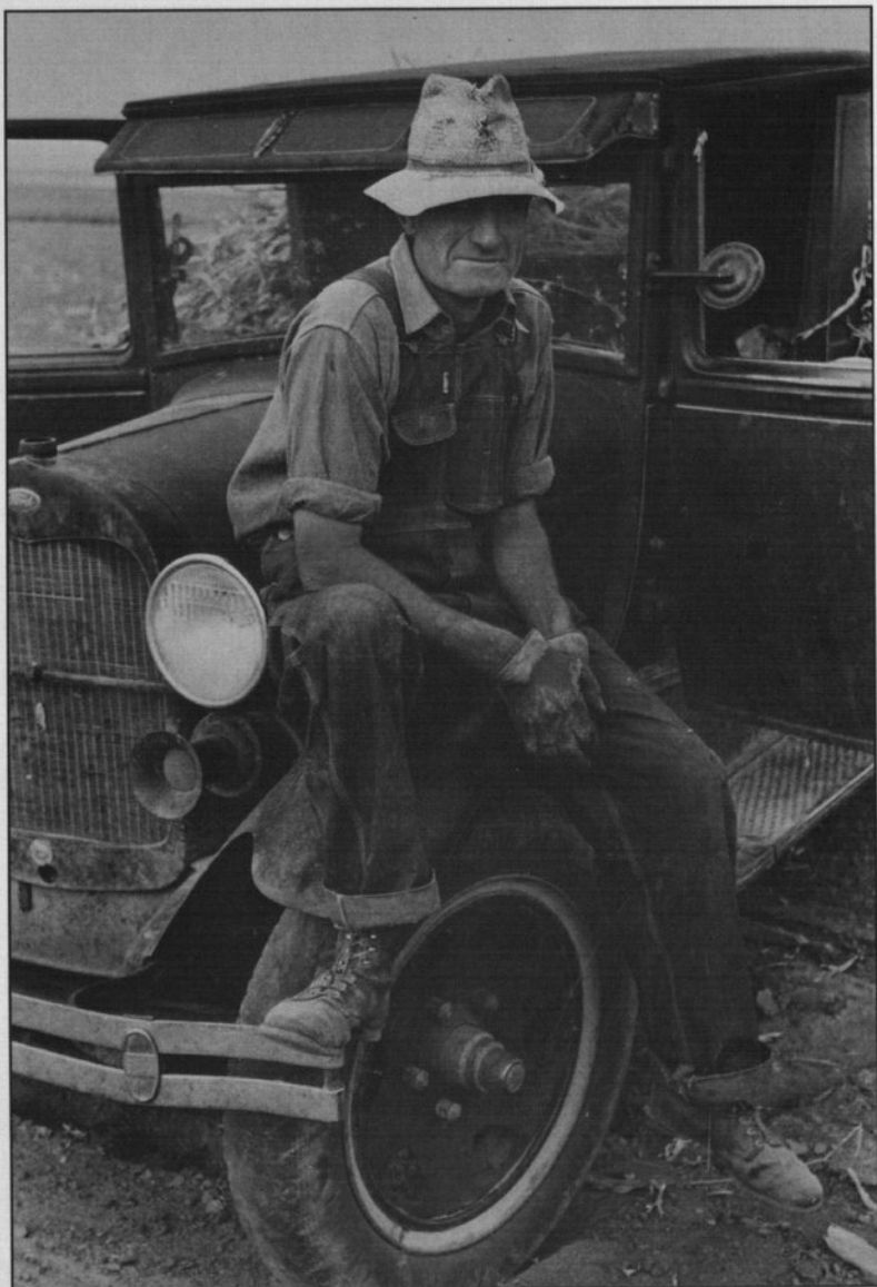
A farmer's hired man in Sheridan County, Kansas, 1939.

Cover and Back Cover: From the farm life depicted in Thomas Hart Benton's Threshing Wheat (cover) to change and protests brought on by hard times (back cover); and from a Kansan famous for his career on the silver screen to a once well-known politician—Kansas has seen its people endure the worst and offer the best during the first decades of the twentieth century.