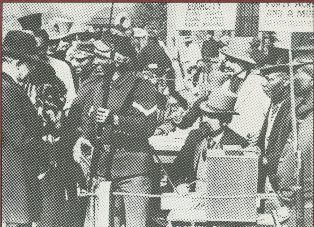
A scene from D. W. Griffith's controversial 1915 silent film, "The Birth of a Nation."