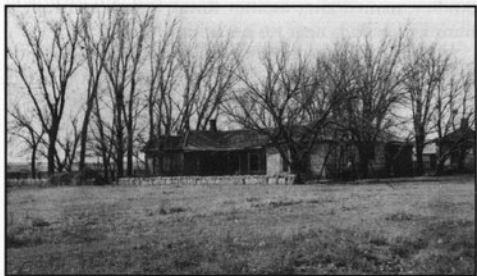
The John Fenton Pratt home, shown here in its completed state with the washhouse on the far right and surrounding cottonwood trees that gave it its name, is today a state historic site.