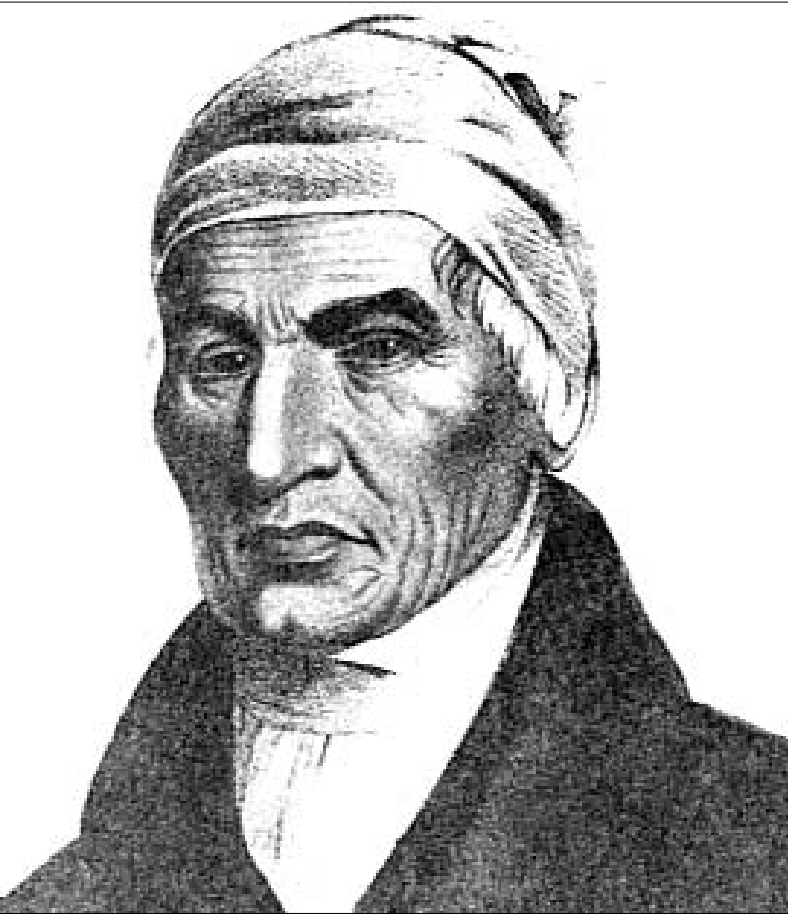
An adversary of Tecumseh and the Prophet, Black Hoof believed in cooperation with white society and modification of the Shawnees' traditional lifestyle.

croachments resulted in the forced resettlement of the Missouri Shawnees to Indian Territory. 12