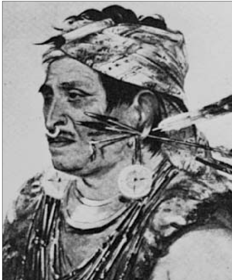
From 1826 to 1828 the Prophet led the first deputation of the Ohio Shawnees to Kansas. There the tribe's traditional culture was threatened by missionaries and agents who sought Indian assimilation.