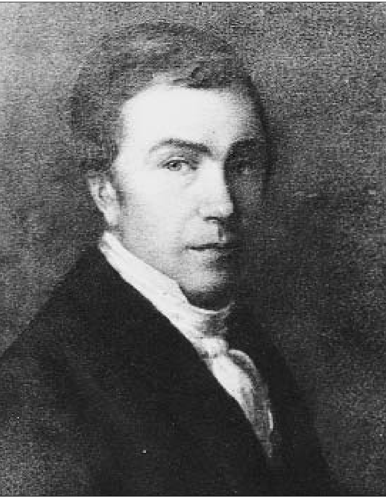
Prominent Baptist missionary Isaac McCoy arrived at the Shawnee reservation in Kansas in August 1830. His plan was to create a stable environment for the Shawnees, through education and religious teaching, that gradually would evolve into a model of Christian civilization.