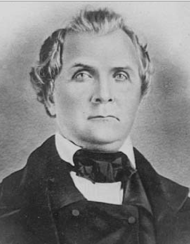
Methodist missionary Thomas Johnson, who arrived in Kansas in November 1830, strongly believed in assimilating the Shawnees into American society. His plan involved religious preaching, agricultural improvements, and creating boarding schools which he believed would “civilize” the Shawnees by destroying tribal bonds.

ment” and his admission that the Shawnees “will be very much displeased if their wishes are not complied with.” 46