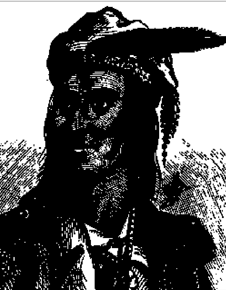
Following the 1813 death of Shawnee leader Tecumseh, the Shawnees could maintain neither their traditional culture nor their autonomy from the advancing white settlements.

and the deplorable conditions that the Wapakoneta Shawnees experienced were indicative of many of the Shawnee removals. One chief lamented: