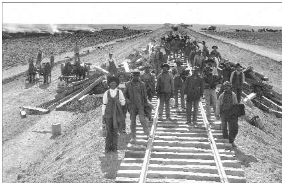
Santa Fe railroad crew in Haskell County, ca. 1912.