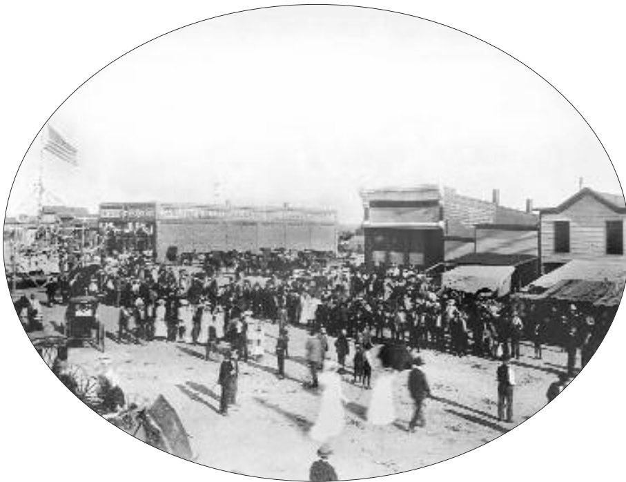
Fourth of July celebration in Coldwater, 1903.