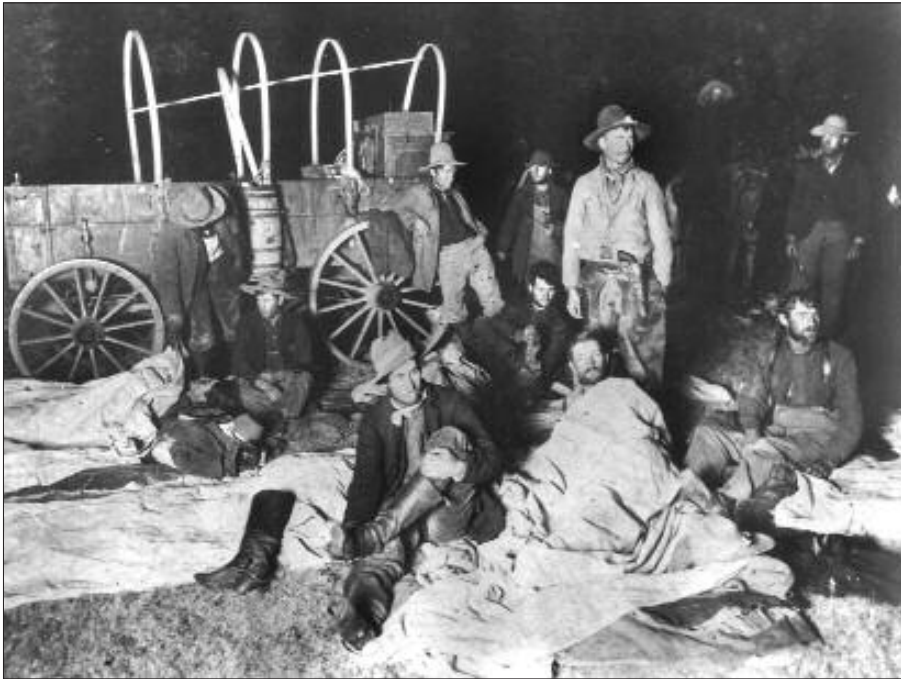
Cowboys from the 3 Block Ranch (New Mexico) going on night guard with cattle being trailed to Sterling, Kansas, 1898.