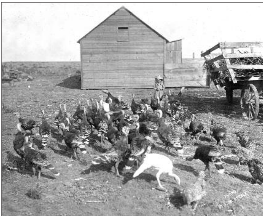
A young girl and a flock of turkeys on an unidentified farm.

plate box, Steele also had a tent darkroom, a glass bath to hold the finishing solution, a tray, water tank, and several pint bottles of chemicals, all told some seventy pounds of equipment to lug around the prairies, not counting the camera itself.