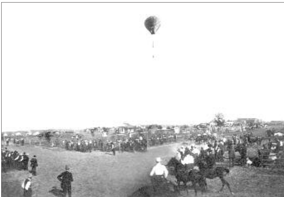
Composite of three photos depicting a horse race and a hot-air balloon at a fair in Ashland.