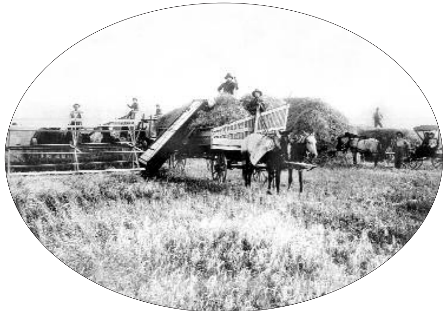
Heading wheat in Kiowa County, 1890s.