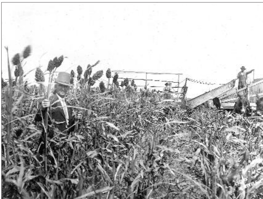
Harvesting kafir corn in Haskell County, 1890s.