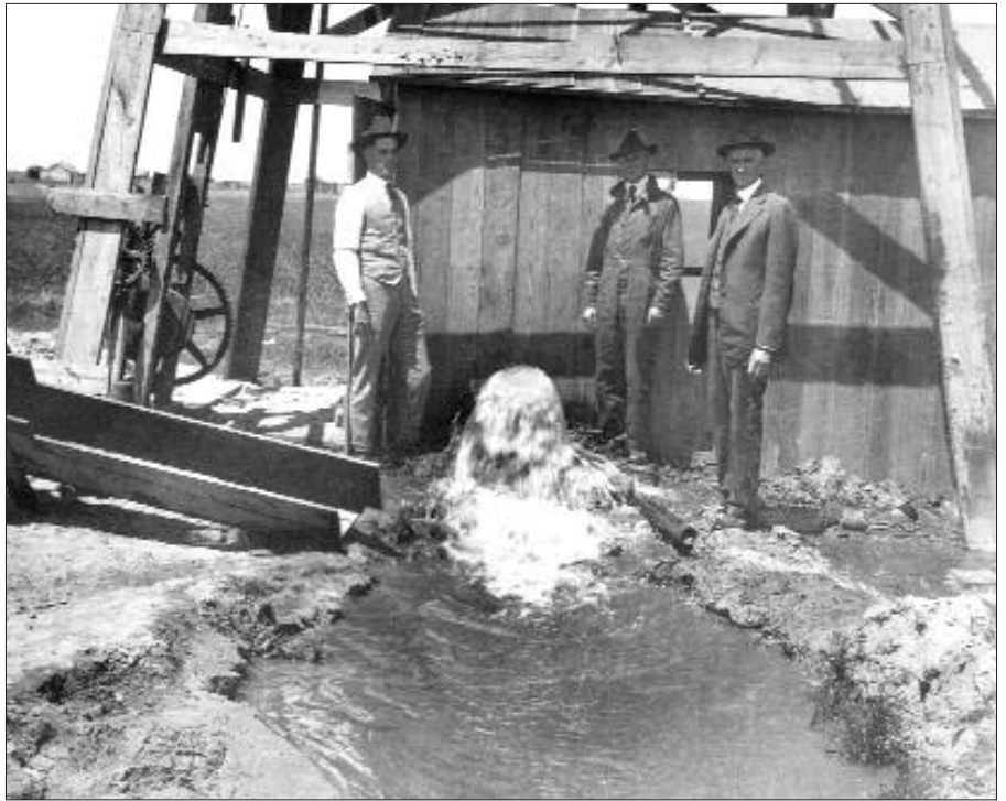
Men at a pump house and irrigation ditch in Seward County.