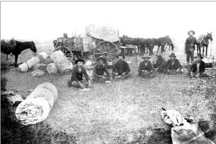
XIT chuck wagon near Buffalo Springs in Texas, 1879.

teen thousand cattle from the 3 Block Ranch in northeastern New Mexico to Sterling, Kansas. One of these photographs, perhaps his most famous, was an unusual nighttime scene of cowboys around a chuck wagon. Some are sitting up in their bedrolls, others are seated on the ground pulling off their boots, while still others are standing around. A mounted rider is faintly visible in the background.