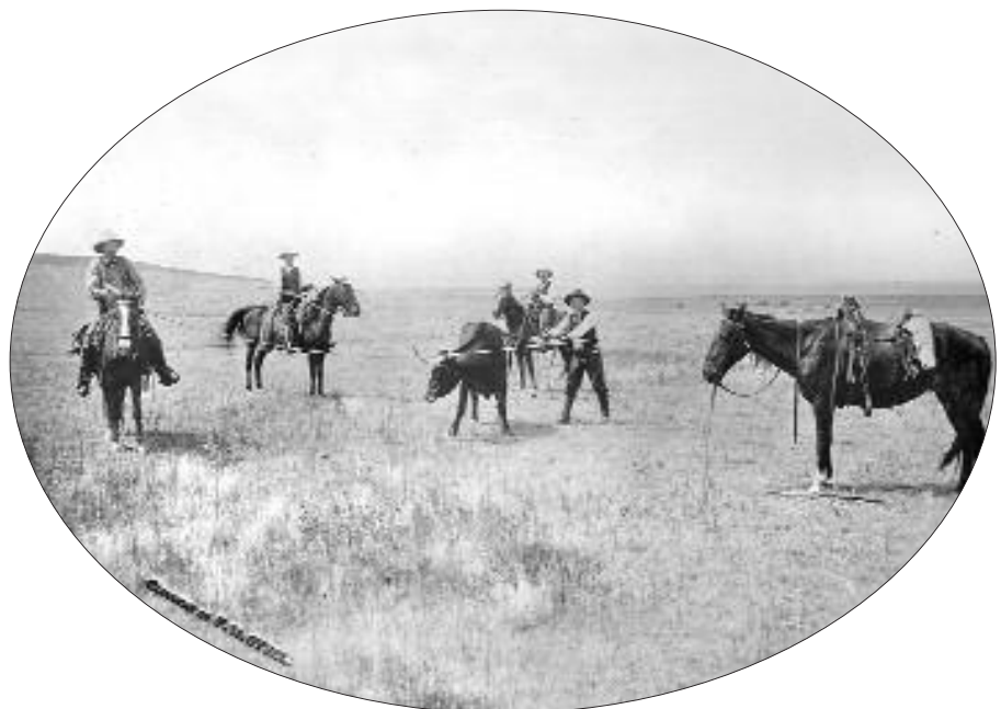
Roping an outlaw steer near Ashland.