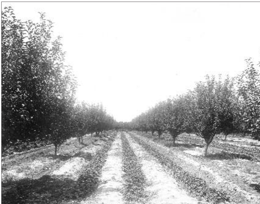
View of an orchard in Seward County.