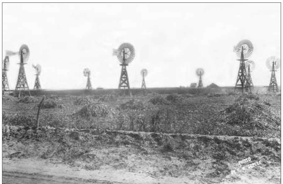
Windmills pumping water into a large tank in Seward County.