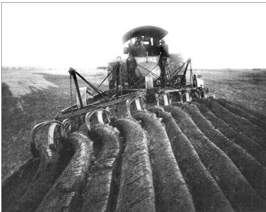
Plowing scene, probably Haskell County.

tographs each. At this point 267 Steele photographs have been digitized by the Kansas State Historical Society. 5