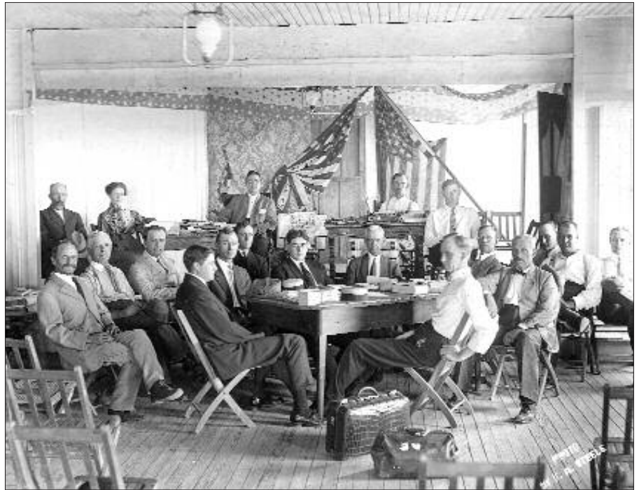
Session of the district court in Haskell County.