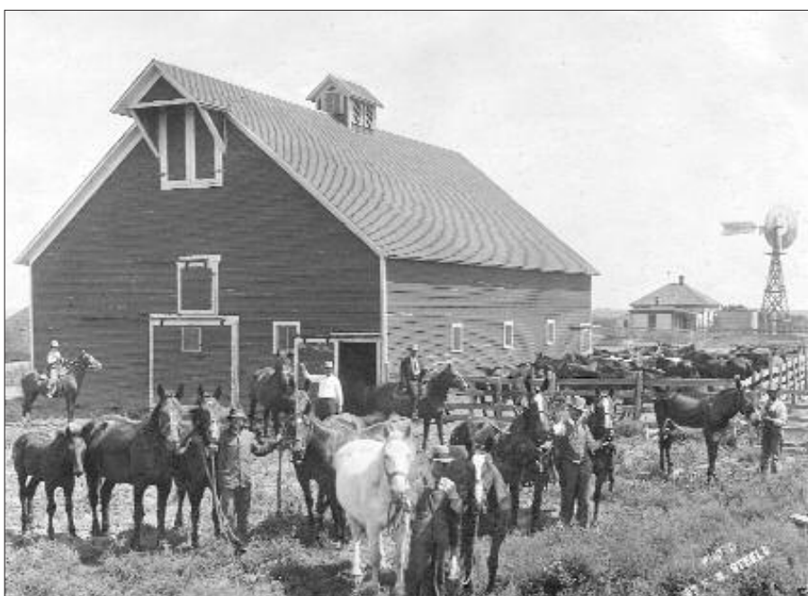
Horses on the Johnson Ranch in northern Haskell County, 1912.